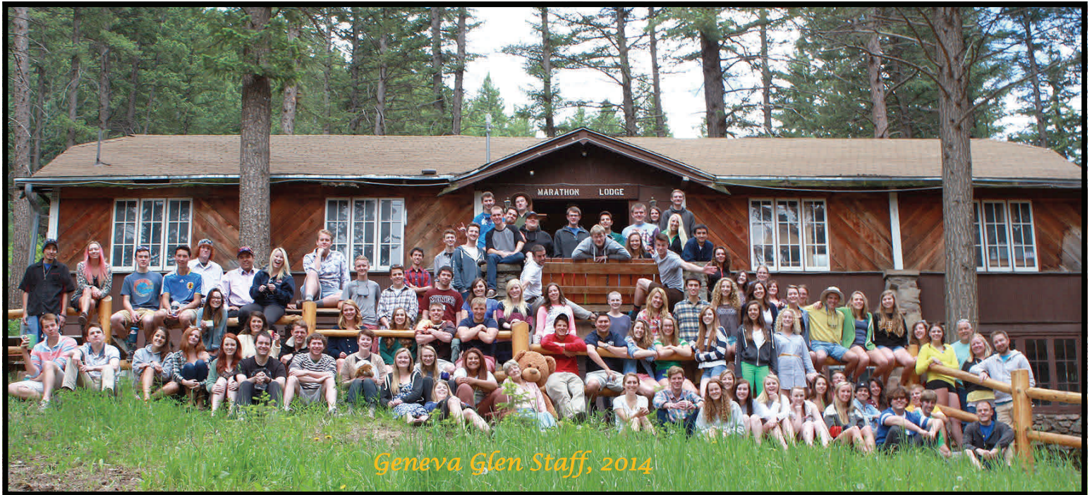
Geneva Glen Staff, 2014

Presenting our wonderful 2014 staff posing for the last time in front of dear old Marathon. As GG embarks on the greatest financial commitment of her 93 year history, the complete remodel of this rustic mountain lodge, built in 1919, we are trusting in the ongoing generosity and active philanthropy of our loyal camp family. We are exceptionally grateful for the gifts we have received thus far to build a new and expanded lodge which affords us invaluable space for indoor activities. The new Marathon will include a staged auditorium able to accommodate all campers when the weather chases us out of the meadow or the council ring. Included will be accommodations for the KGLN Radio station, archery hut, shield shop, a small kitchen for nutrition programs, and the familiar “canteen” camp store! There will be a lot of familiar things you’ll recognize, and as the building grows and matures, it will capture the same sentiment that still applies today—camp will always continue “cherishing the past, seeding the future.”