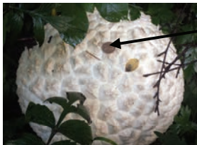
The penny shows the relative size!

And of course all this is from the gall-darnedest wettest