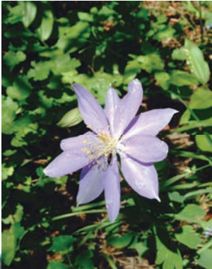
ONE only Geneva Glen Columbine was discovered this year!